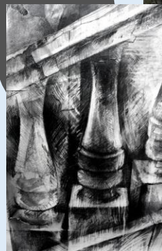
A1 SITE SPECIFIC Large Painting: mini outcome in expressive media

Students create a large-scale sheet mixing media and artist styles / techniques combined in a creative composition based on a short series of tasks used to record structures and architecture from their local area