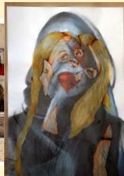
Exam Final Piece

Students develop prep work in sketchbooks and sheets leading towards planning a final piece to be completed in the 3 day exam along with sheet connections that explain and evaluate the work completed throughout the exam period