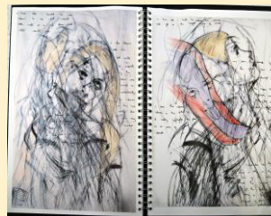
Prep in Books

Students develop prep work in sketchbooks and sheets leading towards planning a final piece to be completed in the 3 day exam along with sheet connections that explain and evaluate the work completed throughout the exam period