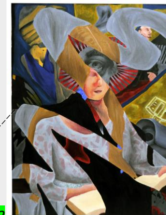
Coursework Final Piece

Y13 Students hand in Component 1 and begin their Component 2 Exam investigation which will run from February of Y13 through to May Y13, in which time they will prepare and finalise their exam portfolio work worth 40% of their final Grade along with preparing for their final 3 day exam