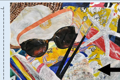
A1 IDENTITY Large Painting: inspired by "Identity Bridging Work & initial development"

Students create a large-scale sheet mixing media and artist styles / techniques combined in a creative composition based on a short series of tasks used to record structures and architecture from their local area