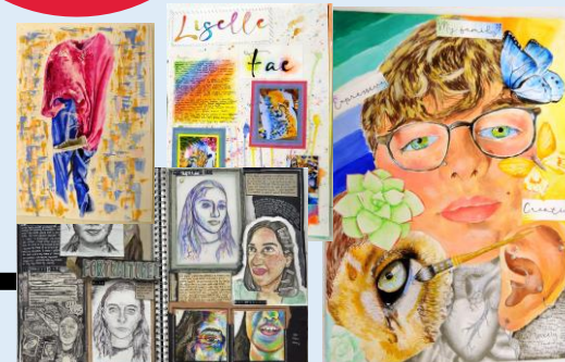
IDENTITY unit development and sketchbook recording